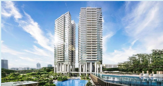
Project name: LIV@MB