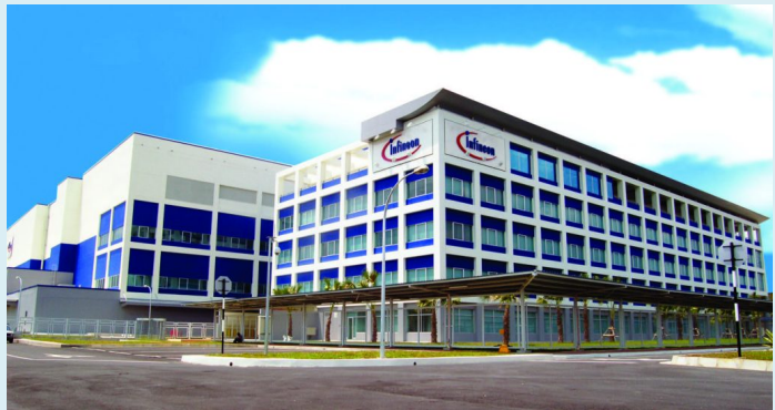
Project name: Infineon Technologies Extension at Penang