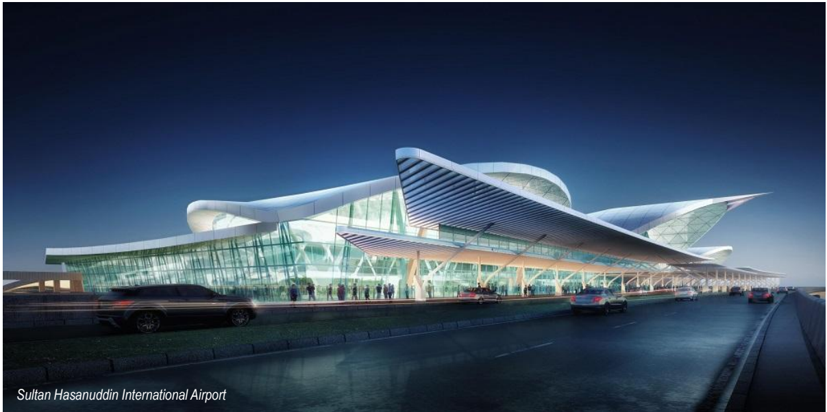
Sultan Hasanuddin International Airport

Since early 2000 Fast Flow has completed over 70 airport projects and drained more than 3,000,000 square metres of airports' roof area in Asia Pacific. For over a decade, Fast Flow has been working closely with its licensed distributor (Siphonic Flow Mandiri) in promoting the company's products and systems in Indonesia. Together they secured and completed 20 airport projects nationwide. The projects include Sultan Hasanuddin International Airport (Makassar, Sulawesi), Kualanamu International Airport (Medan, Sumatra), Ngurah Rai International Airport (Denpasar, Bali), Komodo Labuan Bajo Airport (Labuan Bajo, Flores) and Soekarno Hatta International Airport Terminal 3 Ultimate (Jakarta, Indonesia).